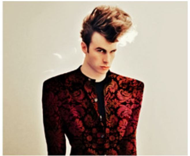
Performance and music video premiere by Dangerous Muse