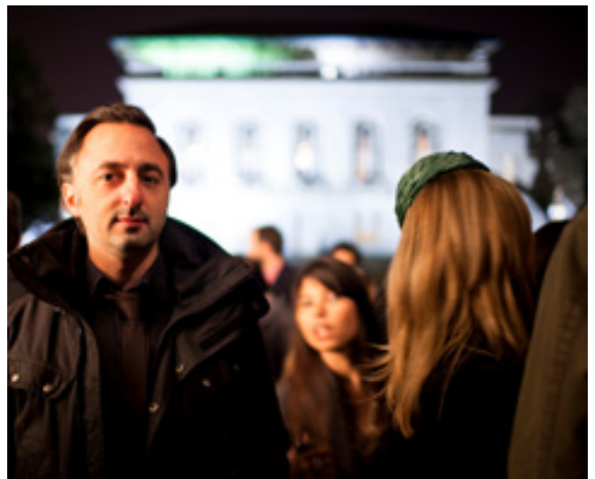
Organization of American States